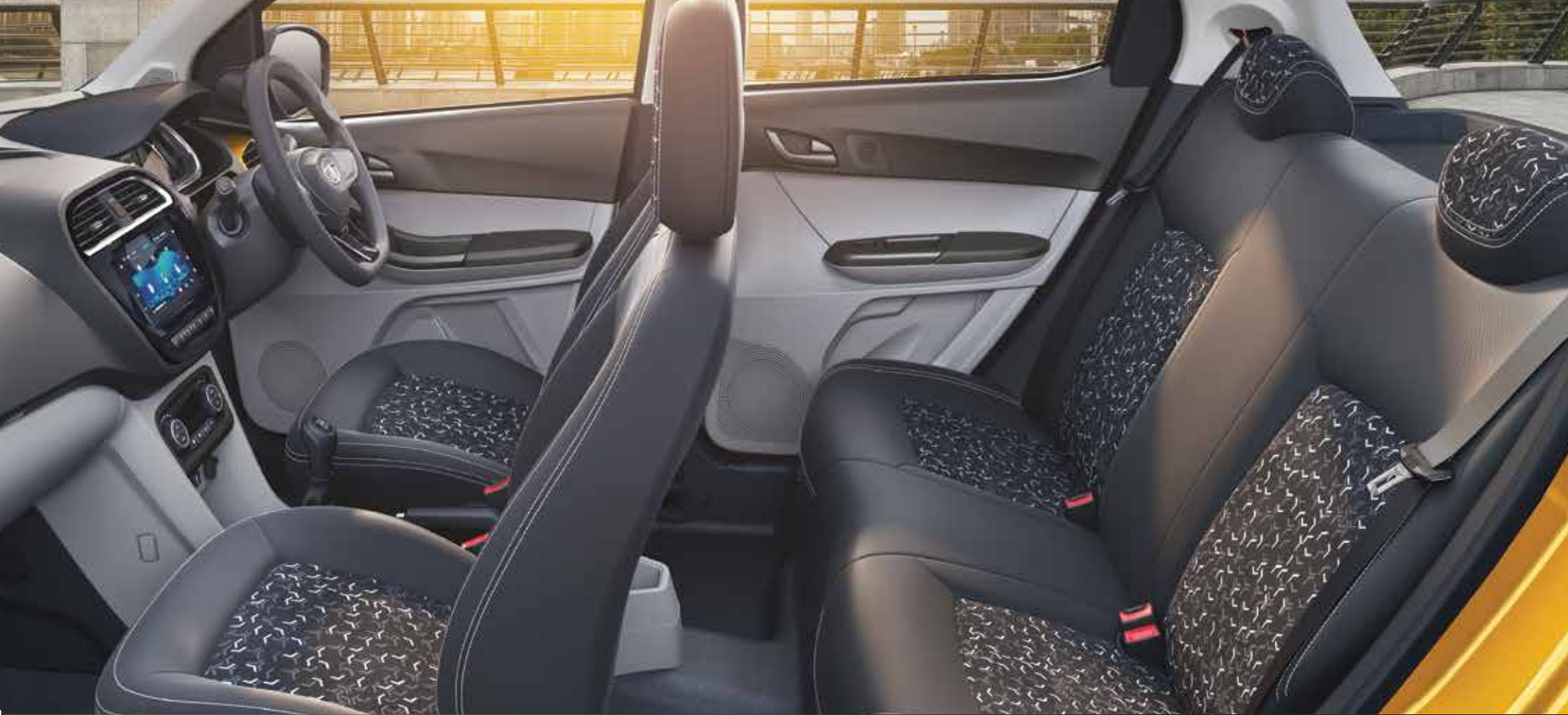
Classy & expansive space with a premium dual tone interior theme. Premium body-hugging seats with elegant dual tone, tri-arrow designed upholstery.