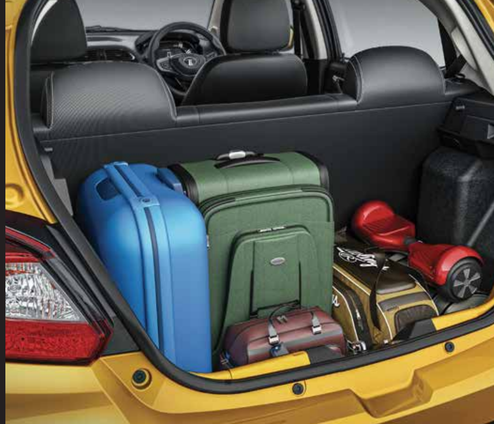
242 l Boot Space