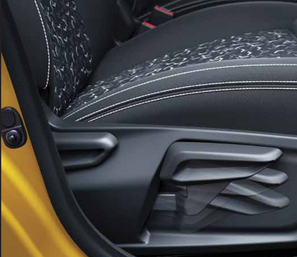
Height Adjustable Driver Seat