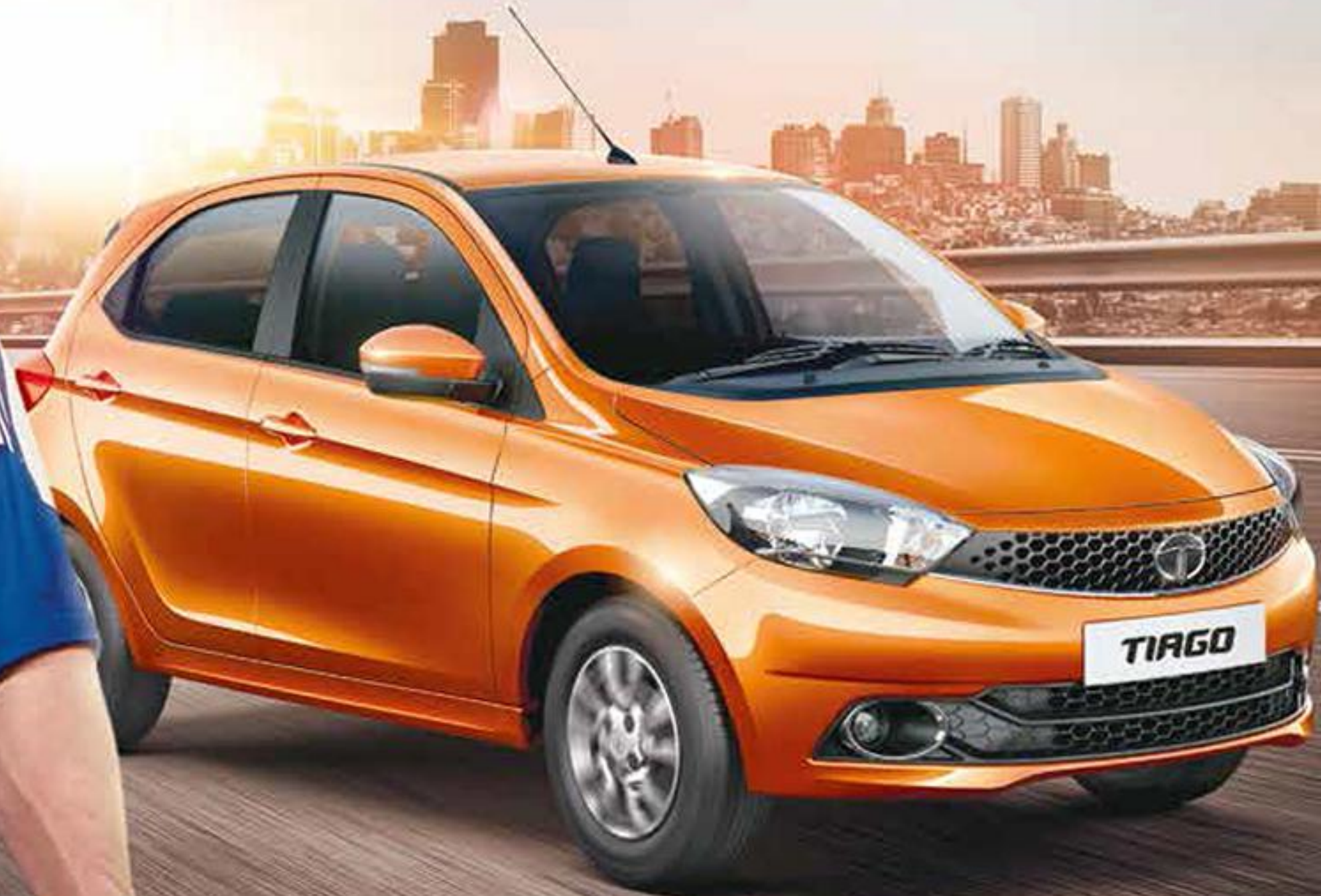
LIONEL MESSI Global Brand Ambassador Tata Motors