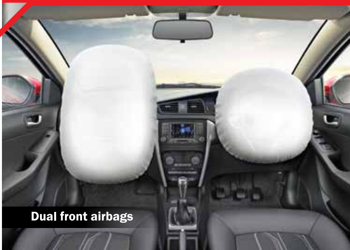
Dual front airbags