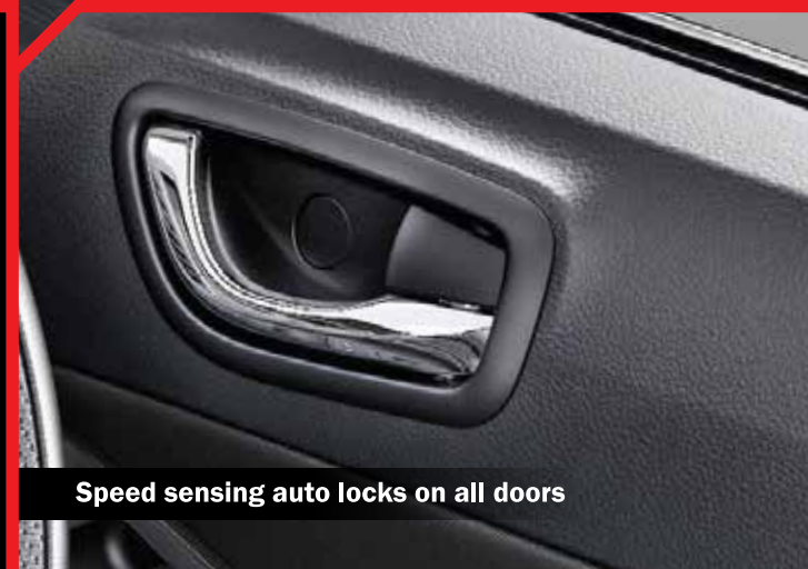
Speed sensing auto locks on all doors