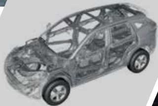
Pedigree of Ω ARC Derived from Land Rover's D8 Architecture