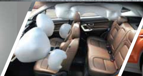
Top-of-the-Line Uncompromised Safety 6 airbags, ABS with EBD, ESP with added functionalities