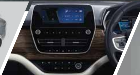
Future Ready Connectivity and Infotainment Floating Island 22.35 cm (8.8") Touchscreen Infotainment with JBL Acoustics