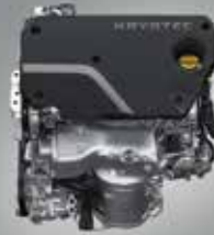
Class Leading Performance and Drivability Cutting Edge Kryotec 2.0L Diesel Engine