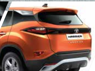
Stunning Impact Design 2.0 Extraordinary Exteriors and Luxurious Interiors