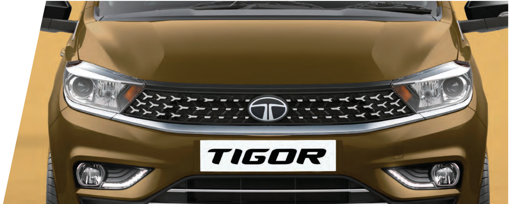
STYLISH CHROMED TRI-ARROW FRONT GRILLE