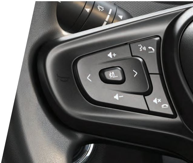
STEERING MOUNTED CONTROLS