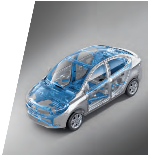
ENERGY ABSORBING BODY STRUCTURE