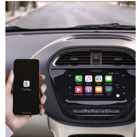
APPLE CARPLAY™ & ANDROID AUTO™