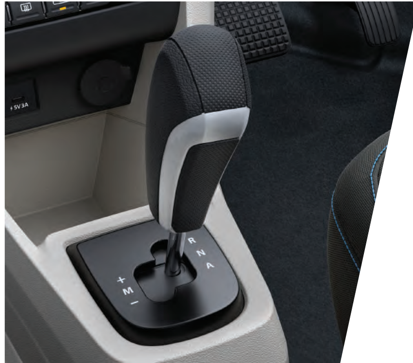
ADVANCED AMT TRANSMISSION