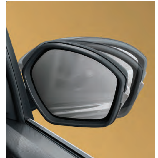
AUTO FOLD ORVM WITH WELCOME FUNCTION