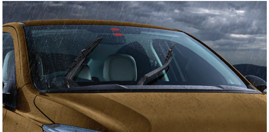
RAIN SENSING WIPERS