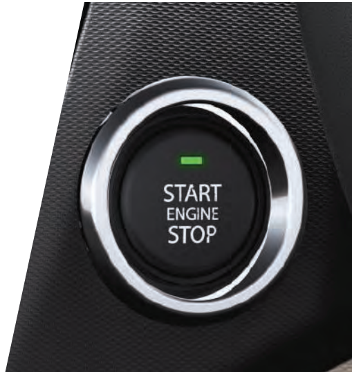
PUSH BUTTON START