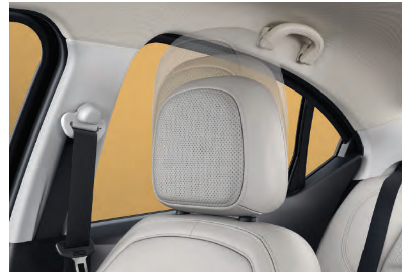
FRONT ADJUSTABLE HEADREST