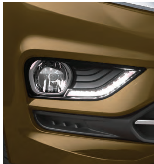
FRONT FOG LAMPS WITH CHROME RING SURROUNDS