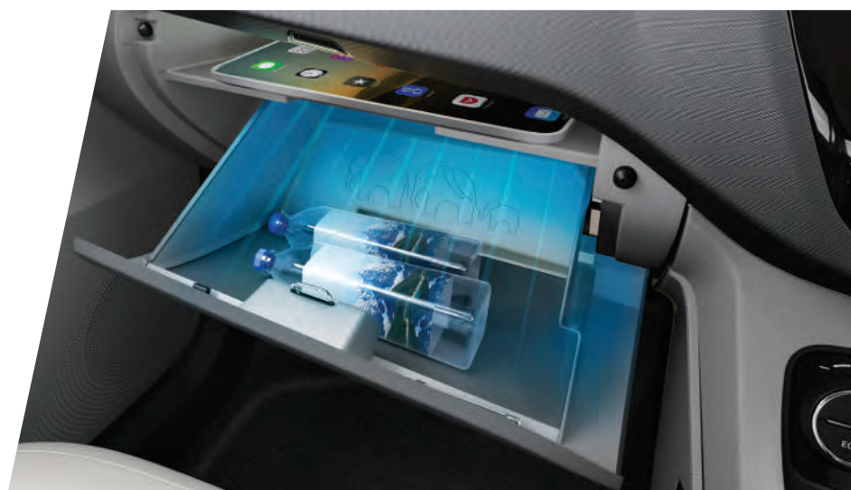
COOLED GLOVE BOX