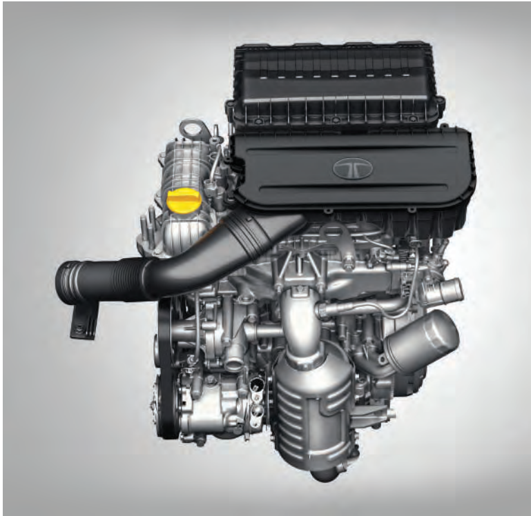
1.2L REVOTRON BS6 PH2 ENGINE