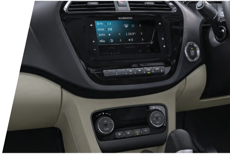
FULLY AUTOMATIC TEMPERATURE CONTROL