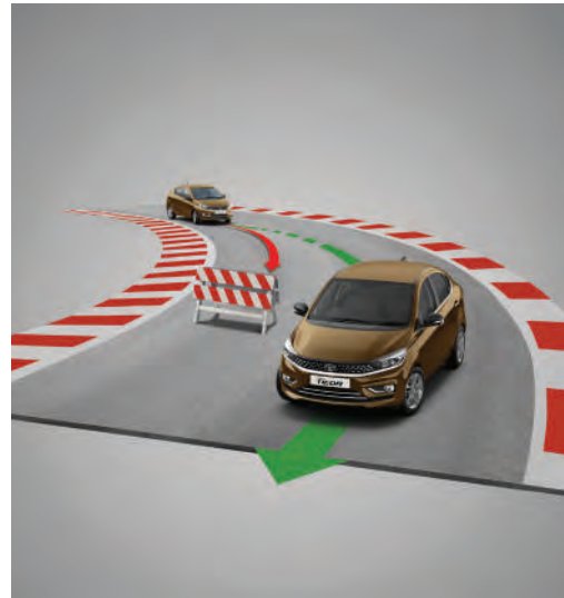
ABS WITH EBD AND CORNER STABILITY CONTROL