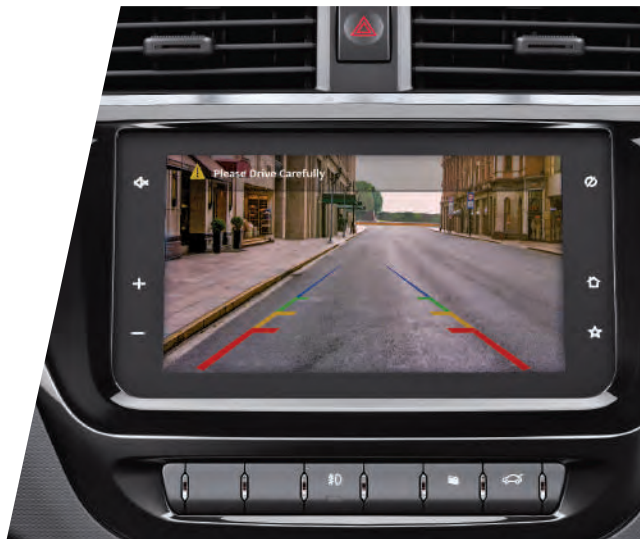
REVERSE PARKING ASSIST WITH CAMERA AND REAR PARKING SENSOR