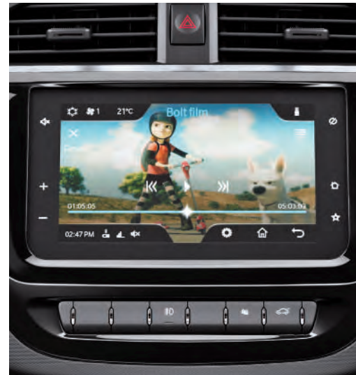
IMAGE & VIDEO PLAYBACK