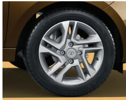
R15 SONIC SILVER ALLOY WHEELS