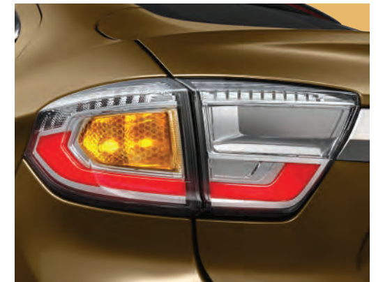
BOLD & BRIGHT LED TAIL LAMPS