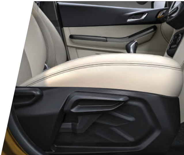
HEIGHT ADJUSTABLE DRIVER SEAT