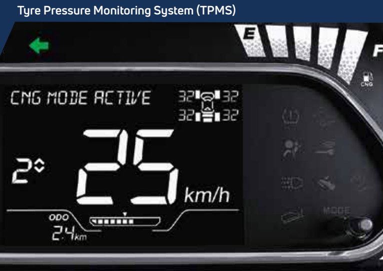
Tyre Pressure Monitoring System (TPMS)