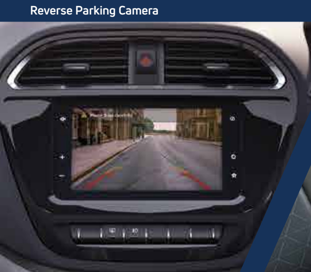
Reverse Parking Camera