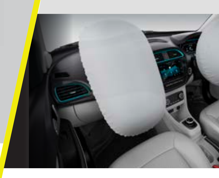
Dual Front Airbags

Waterproof, Dustproof and Worry-IP67 rated battery pack & motor.